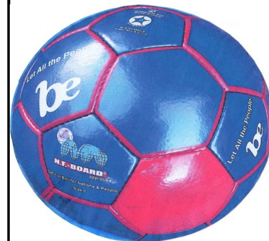
Designer & Manufacturer : Be-Rug-Be.

Adopted at the Meeting of the Executive Committee of the N.F.-Board and the General Meeting of June 11th, 2005 in London, this high quality ball (the standard international competitions) will be the official brand of football Peoples and Nations launched in partnership with the manufacturer of the famous Balloons "Be-Rug-Be" supplier of the FIRA-AER and the IRB.