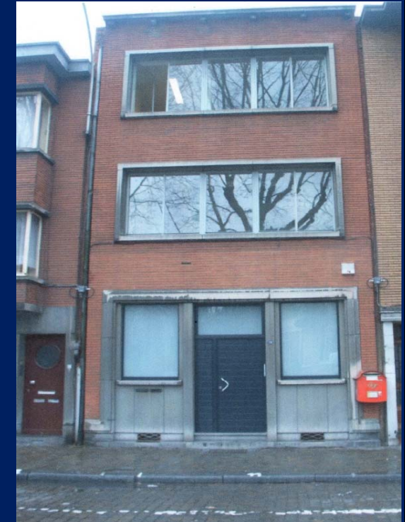
The pub "A la Mort Subite" in Brussels :